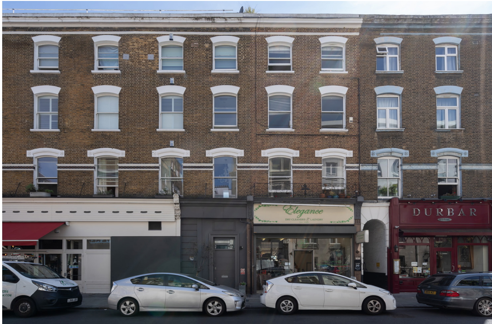
Arguably one of Notting Hill's most vibrant and fashionable streets, Westbourne Grove is home to a wealth of boutiques, eateries and amenities.