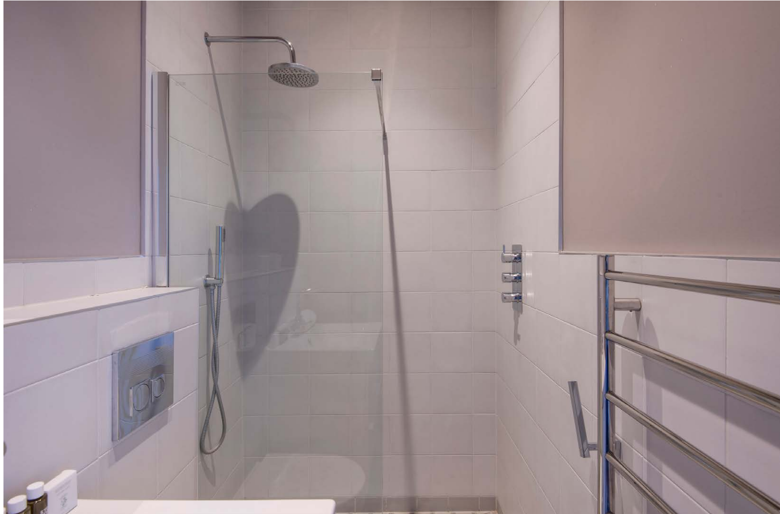
A stylish, tiled bathroom has a walk-in rainfall shower and modern fittings.