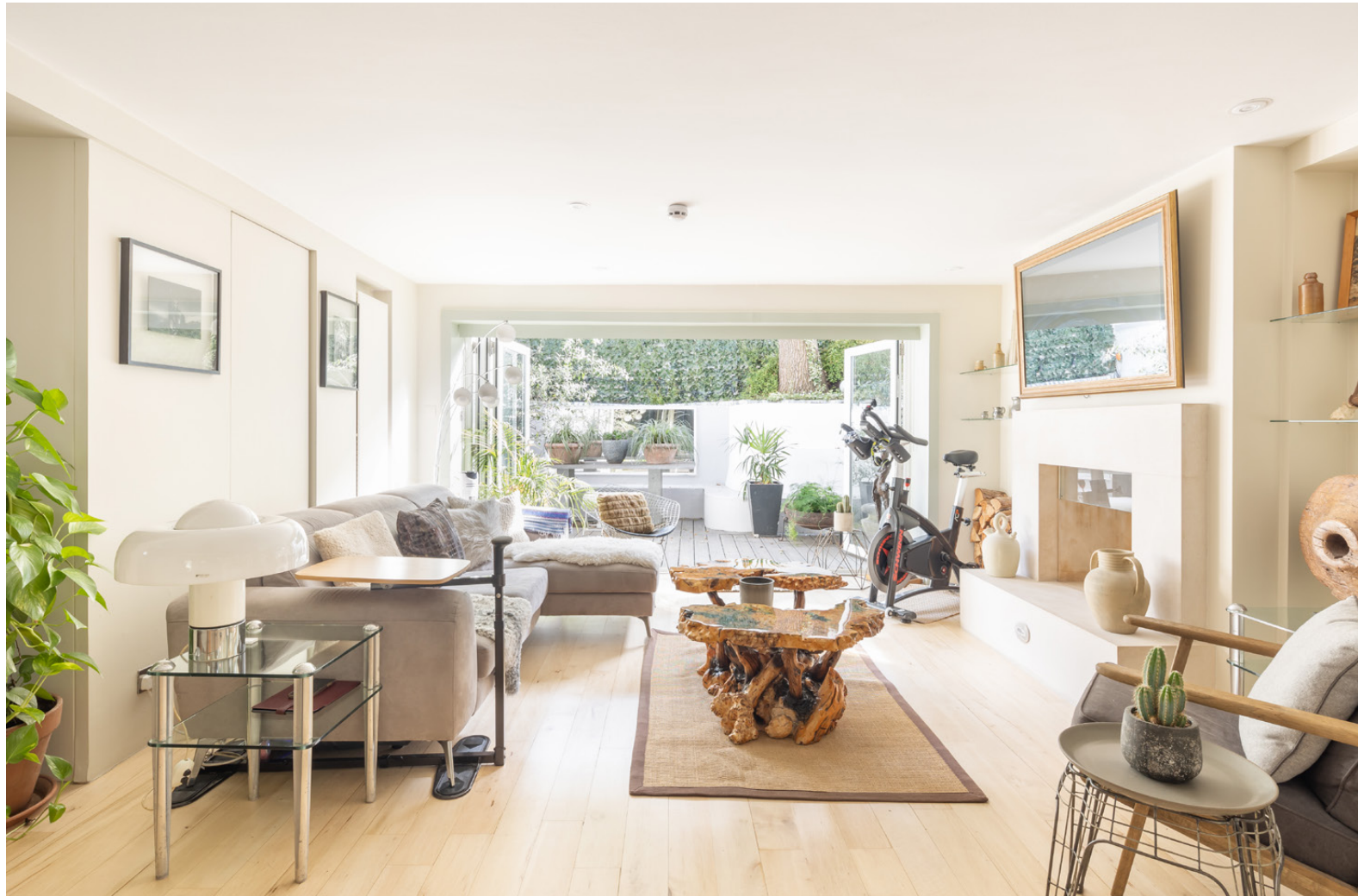
A considered palette of colours runs from room to room; think calming sands, warm terracottas and sophisticated ivories.