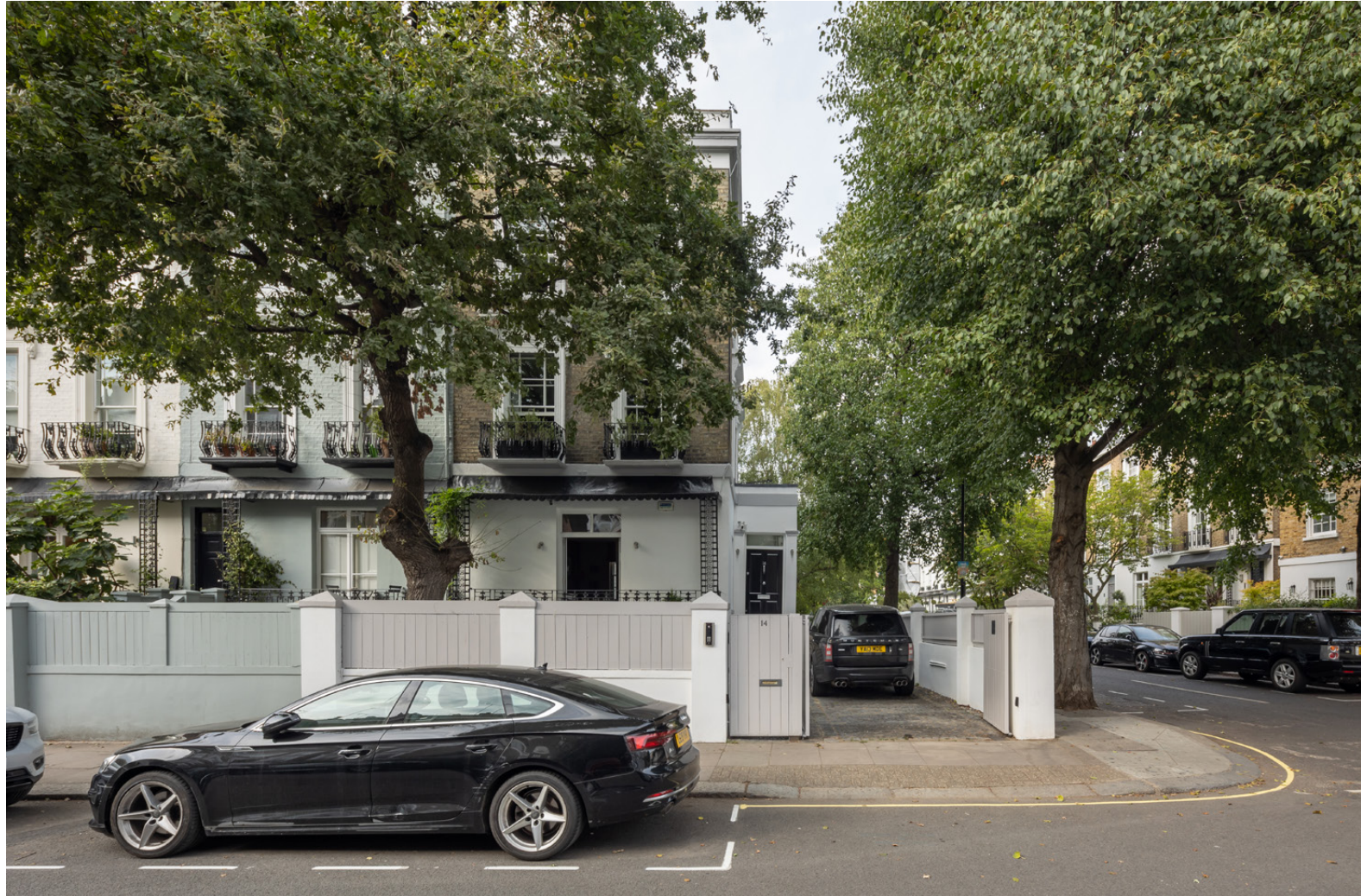
Artesian Road is just a stone's throw away from some of Notting Hill's best offerings.