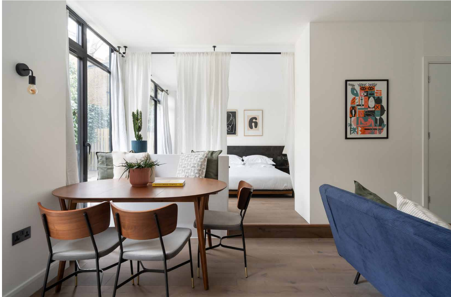
Floor-to-ceiling windows and doors that open onto the courtyard let natural light flood in.