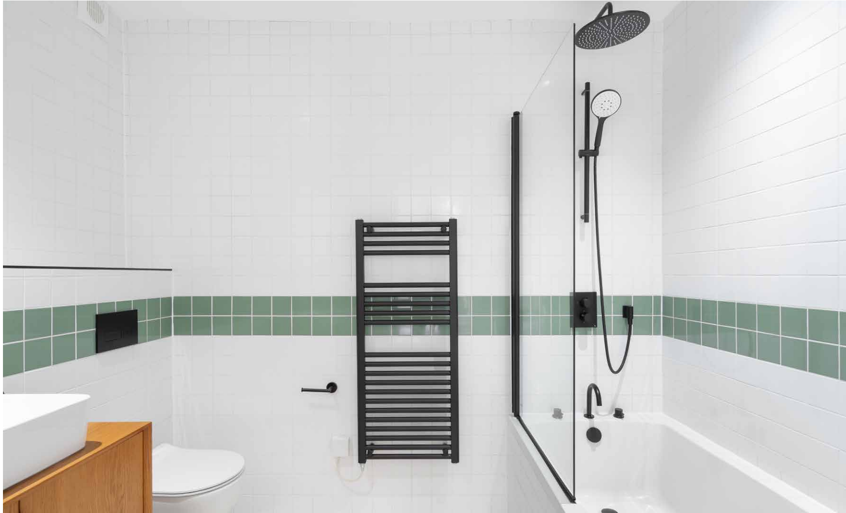
The sage green Solus tiles in the bathroom next door provide a refreshing pick-me-up to complement the black and white theme. Relaxation is assured thanks to the large rainfall shower positioned over an inviting bathtub.