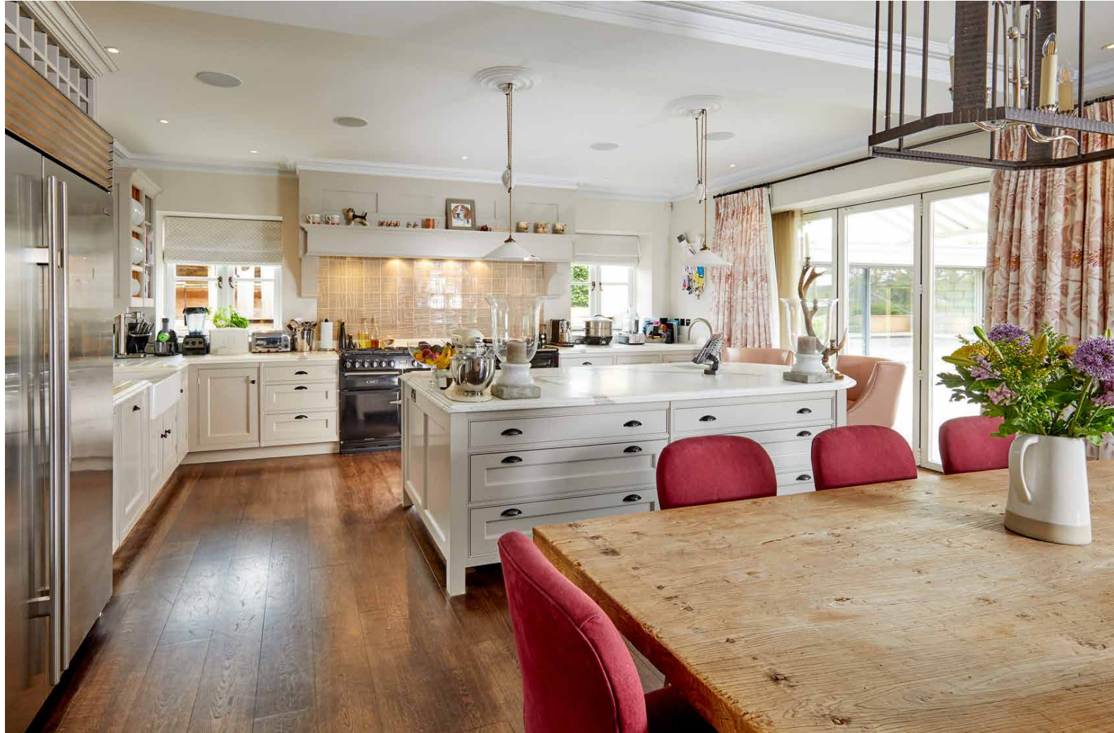
Classic meets contemporary in rustic rooms with modern comforts.